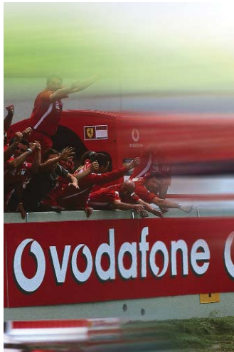
changing the face of communication . . . page 37